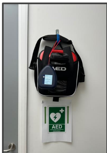
Junior School Reception Lobby